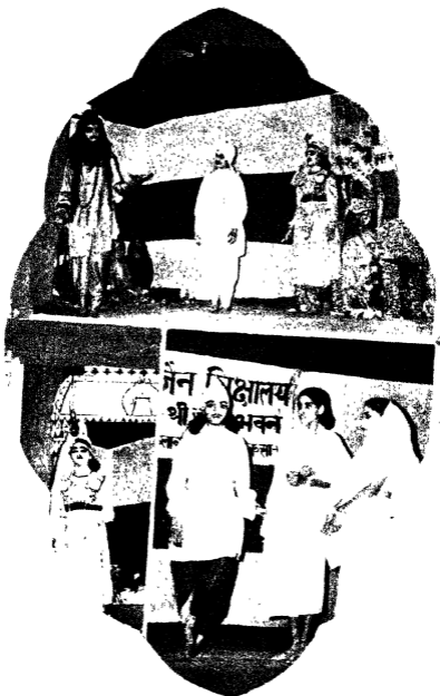
Top—Kaula Vira Bharava arousing the flame of passion in the heart of king Maridatta who immediately orders the sacrifice of thousands of beings Bottom—King Maridatta experiencing the unbounded serenity of non-injury at the very presence of the young saints who are embodiments of love and forgiveness.